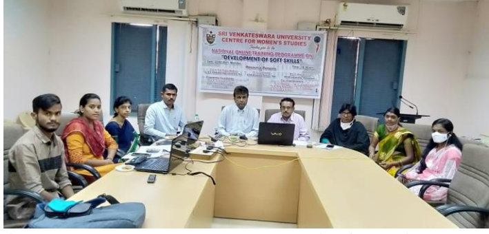
Awareness Programmes and RalliesOrganised:

Online Training Programme on "Development of Soft Skills" 22/02/2021