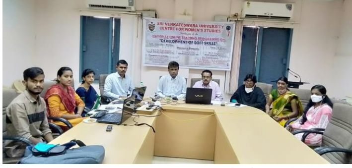
Awareness Programmes and RalliesOrganised:

Online Training Programme on "Development of Soft Skills" 22/02/2021