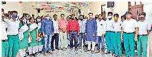
క్విజ్ పోటీల్లో పాల్గొన్న విద్యార్థులు