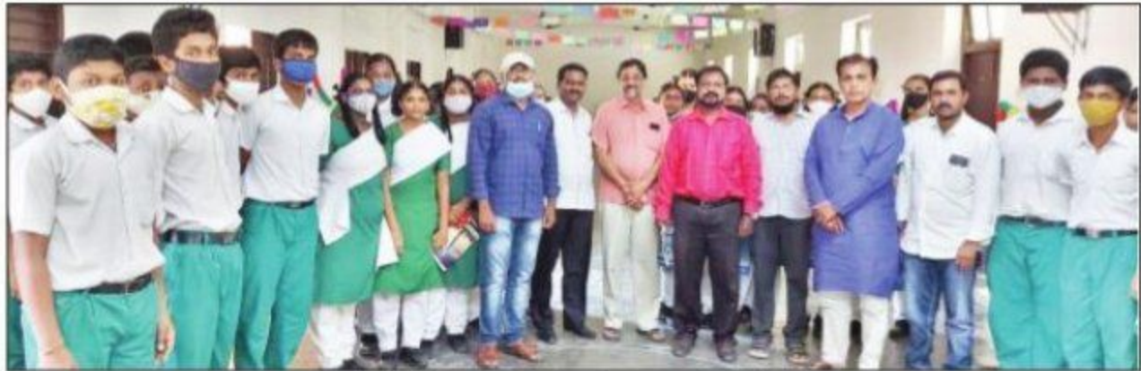
పోటీల్లో పాల్గొన్న విద్యార్థులు, నిర్వాహకులు

తిరుపతి రూరల్ ఏప్రిల్ 7 ప్రభ న్యూస్: శ్రీ వేంకటేశ్వర విశ్వవిద్యాలయంలో అంబేద్కర్ జయంతి వారోత్సవాల్లో భాగంగా రెండవ రోజు బుధవారం ఎస్ వి యూ క్యాంపస్ స్కూల్ నందు విద్యార్థులకు డాక్టర్ అంబేద్కర్ జీవితం మరియు భారత రాజ్యాంగంపై క్వీజ్ పోటీలు నిర్వహించారు. అనంతరం ఎస్ వి యూనివర్సిటీ ఆర్ట్స్ బ్లాక్ ఆడిటోరియం నందు వర్సిటీ విద్యార్థులకు అంబేద్కర్ సామాజిక న్యాయం అనే అంశంపై వ్యాసరచన పోటీలు నిర్వ