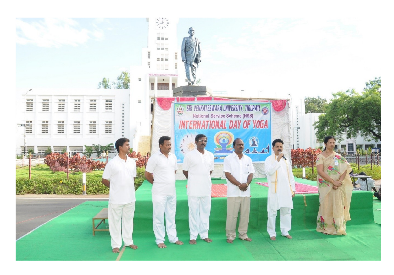
International Yoga Day 2019