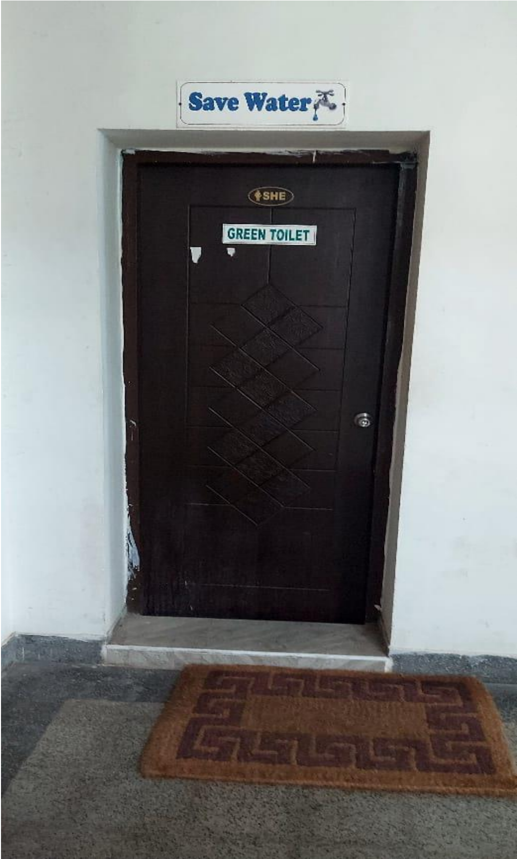
Green Toilet Facility For Women