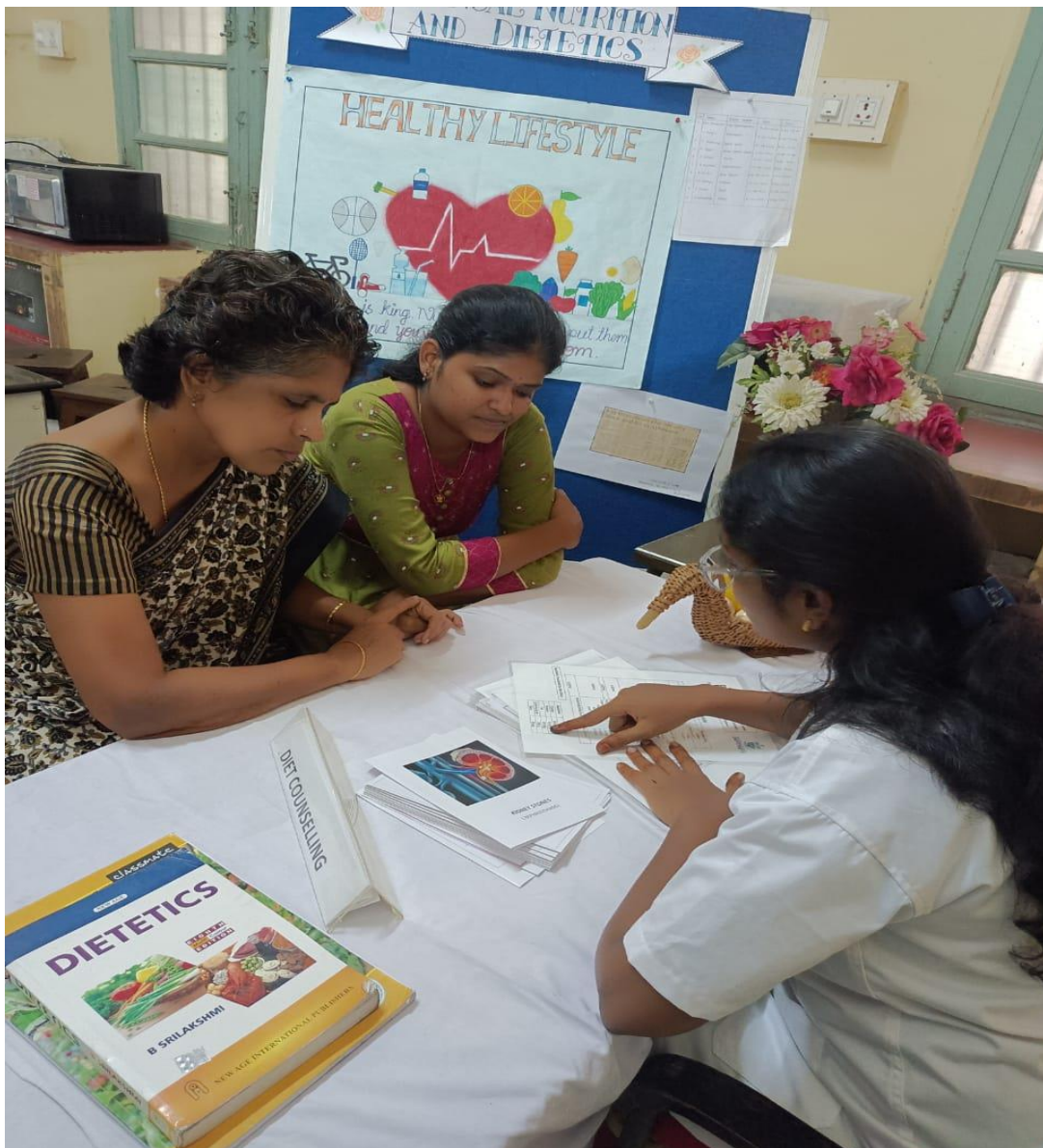
Diet and Nutrition Counselling

Need based Personal Health, Nutrition and Diet counselling sessions are organized with the assistance of the Nutrition and Diet Counselling Centre in the Department of Home Science respectively. The students, Teaching and Non- teaching staff are also getting the benefits from the counselling Centre in order to help and support the students and staff of the campus related to health, diet and nutritional aspects. The students of food Science, Nutrition and dietetics are preparing Diet charts for various diseases and help the needy individuals regarding diet and nutrition counselling for their health problems.