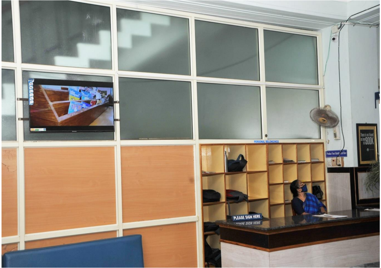
CCTV Footage view