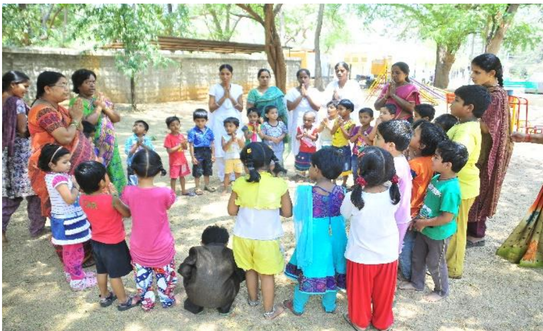
Prayer by the Children