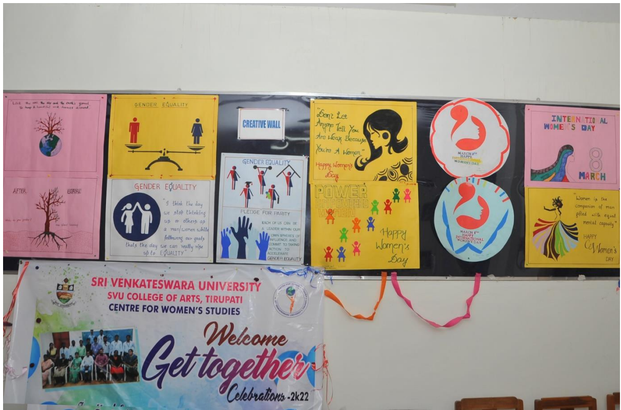
Awareness Programme on Centre For Extension Studies & Centre For Women Studies