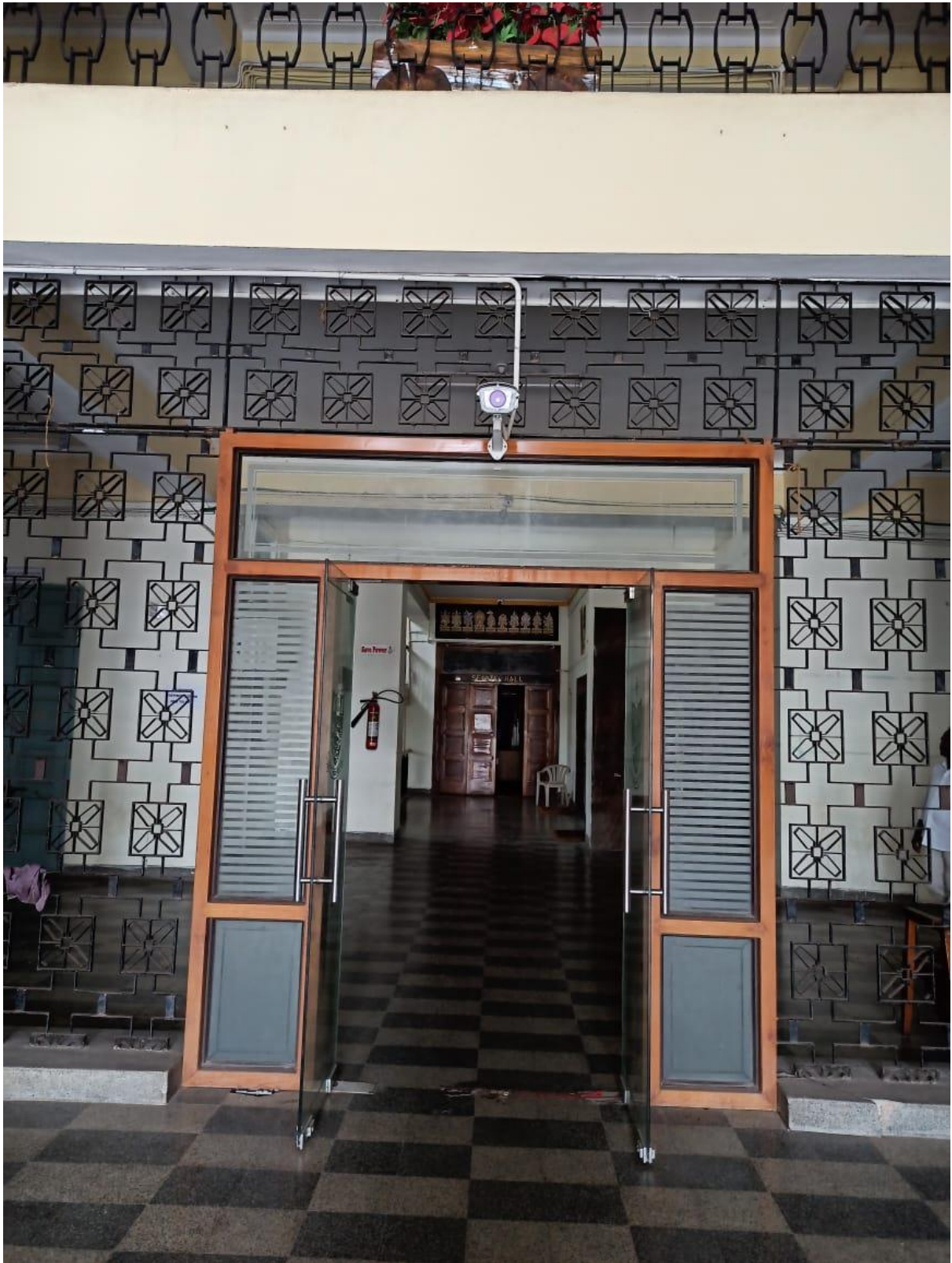
Installation Of CCTV Cameras Throughout The Campus