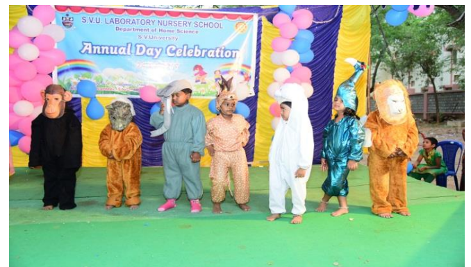
Annual Day Celebrations