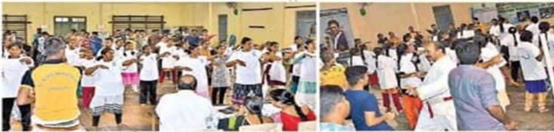
కరాటేలో శిక్షణ పొందుతున్న విద్యార్థినులు

అదనపు అత్యుత్తము కల్పించడం ద్వారా రాష్ట్ర ప్రజలకు 'మొవ' వల్ల అవి సూపర్ ఎడ్యుకేషన్ ' అంధ్రప్రదేశ్ మహిళా సమర సొసైటీ సంయుక్త అధ్యక్షులలో 'బాలికలకు అత్యుత్తములో శిక్షణ' కార్యక్రమాలకు ఎస్సీయూ కేంద్రంగా శ్రీవారం ఉద్భవించింది. కమన్వెల్త్ ఆఫ్ సూపర్ ఎడ్యుకేషన్ అధ్యక్షులలో పాఠశాలలో బాలికల సంక్షేమానికి క్షేత్రస్థాయి రహస్య చేపట్టింది. ఈ దశలోనే బాలికలపై దాడులను అరికట్టడానికి ప్రత్యేక ప్రణాళికలను రచించింది. ప్రణాళికలో భాగంగా బాలికల సంక్షేమానికి క్షేత్రస్థాయిలో టీమ్ కేవలమే ఉద్దేశ్యం. రాష్ట్ర ప్రభుత్వంలో 5 ఏవేరికను అందజేస్తూ, పాఠశాలలో ప్రస్తుతం అమలు చేస్తున్న క్రీడా కార్యక్రమాలలో పాటుగా ప్రతిష్టాత్మకమైన కరాటే విద్యపై బాలికలకు ప్రత్యేక శిక్షణ ఇవ్వడం ద్వారా వారిలో మనోబలం టీమకూడవచ్చునని ఆదేశాలు అలోచన ఈ నేపథ్యంలో రాష్ట్ర వ్యాప్తంగా అత్యుత్తము విద్య కార్యక్రమాన్ని ప్రతిష్టాత్మకంగా టీమకూడ ప్రభుత్వం అన్ని జిల్లాల్లోని పాఠశాలలు, కళాశాలల్లో బాలికలకు అందిస్తూ తొలిదశలో అవగాహన కార్యక్రమాలను నిర్వహించింది.