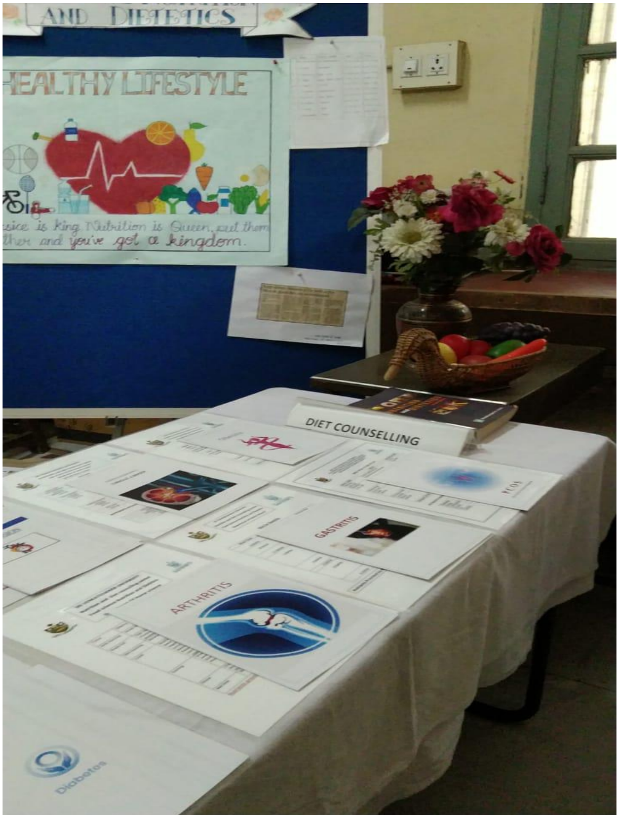
Booklets of Various Diseases