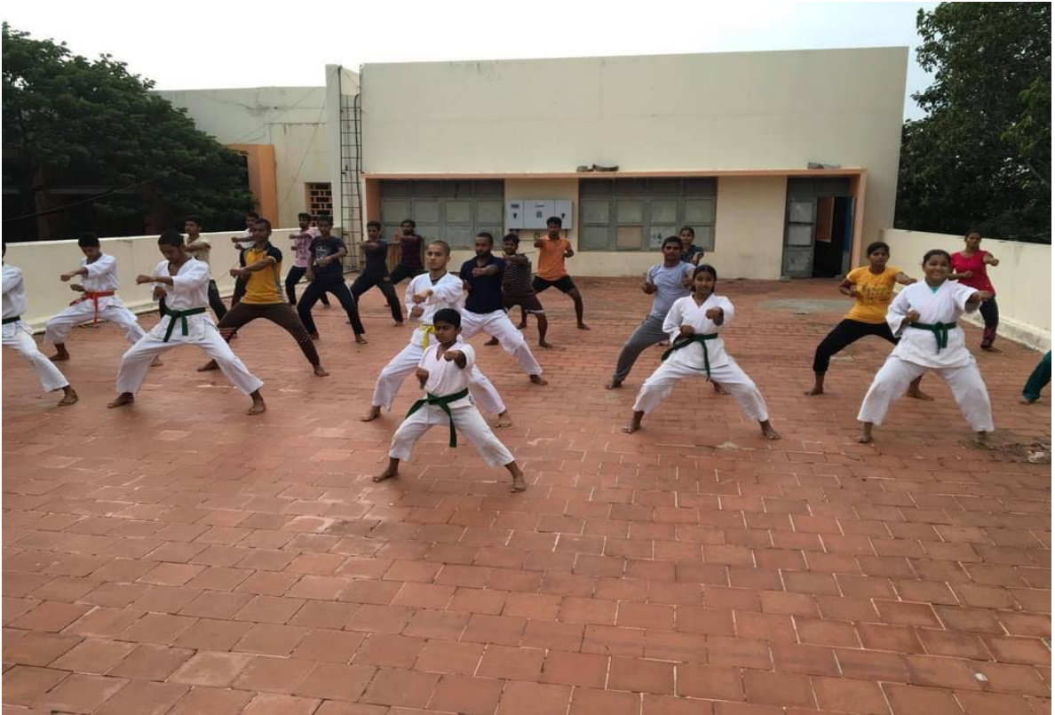
Training Students For Self-Defense