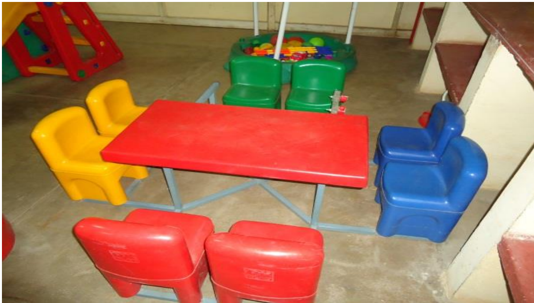
Air conditioners and child friendly furniture.