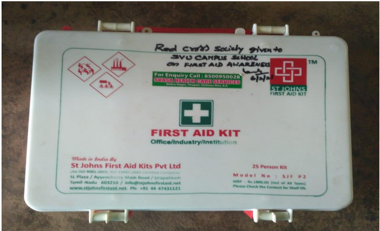
First Aid Kits Available In Hostels