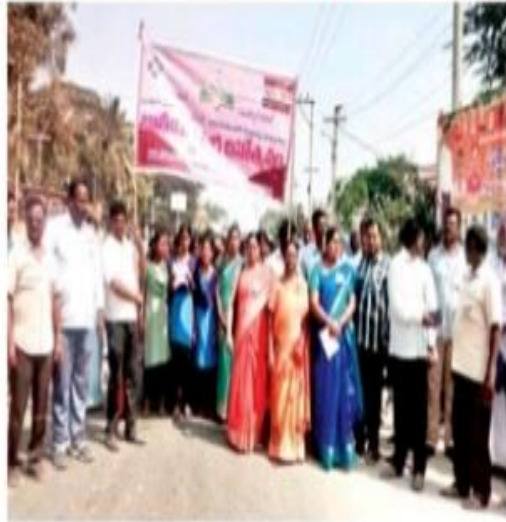
సన్మానం - గంగాధరనెల్లూరులో విద్యార్థులు, అధికారుల ర్యాలీ

ం పురస్కారం జరిగింది. నిండిన కార్యక్రమంలో వీఆర్వోల