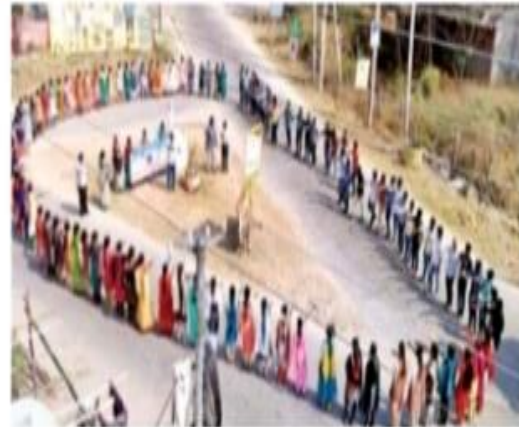
పెనుమూరులో విద్యార్థుల మానవహారం