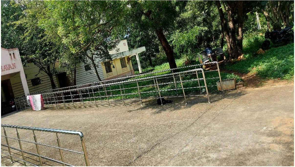
Divyangan friendly path