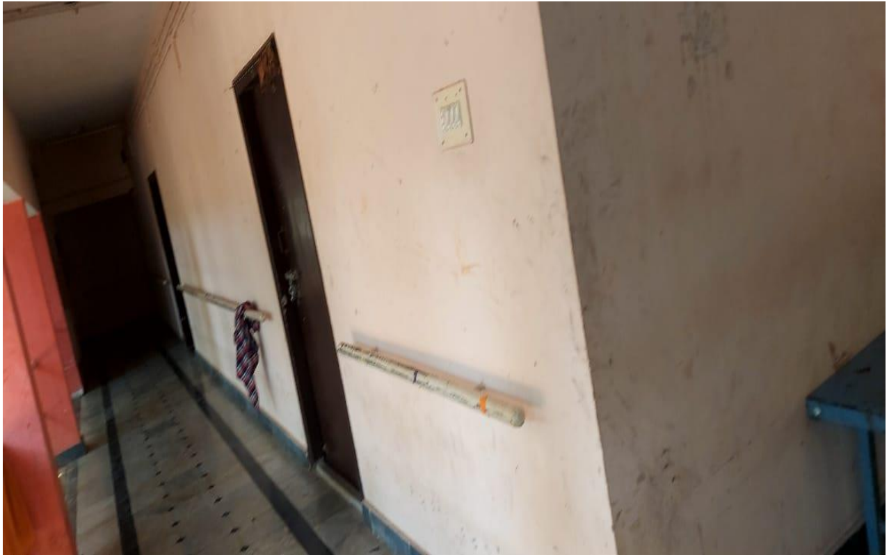
Divyangan Friendly Ramp