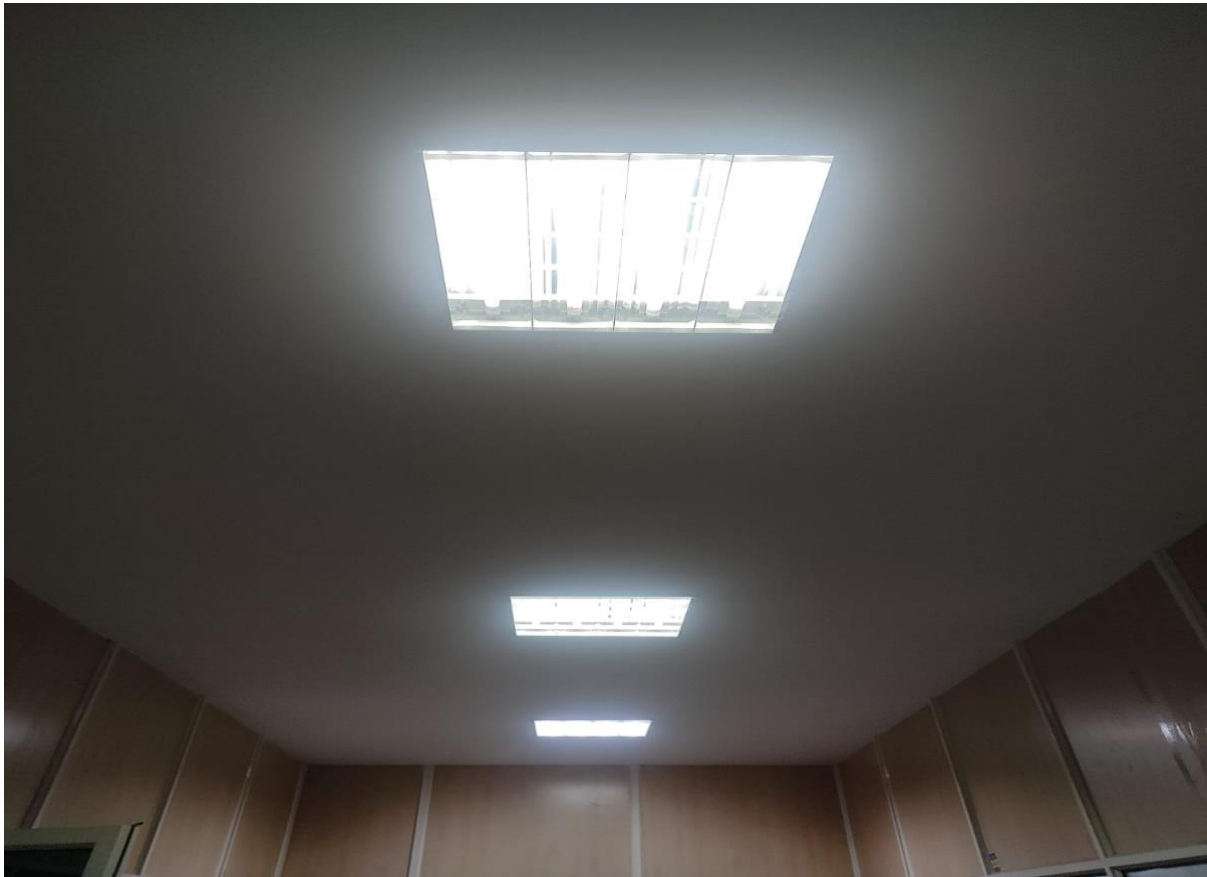
LED Lights in various buildings of the Campus

Power crisis is one of the most common problems in India. LED is a highly energy efficient lighting technology, and has the potential to fundamentally change the future of lighting in India. With the help of LED, we can eliminate this shortage by minimizing the wastage of electrical power or saving our generated power. Light-emitting diode (LED) is one of today's most energy-efficient and rapidly developing lighting technologies. Quality LED light bulbs last longer, are more durable, and offer comparable or better light quality than other types of lighting. LEDs, use at least 75% less energy, and last 25 times longer, than incandescent lighting. Widespread use of LED lighting has the greatest potential impact on energy savings in the campus.