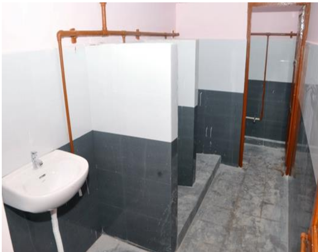
Eco Friendly washrooms