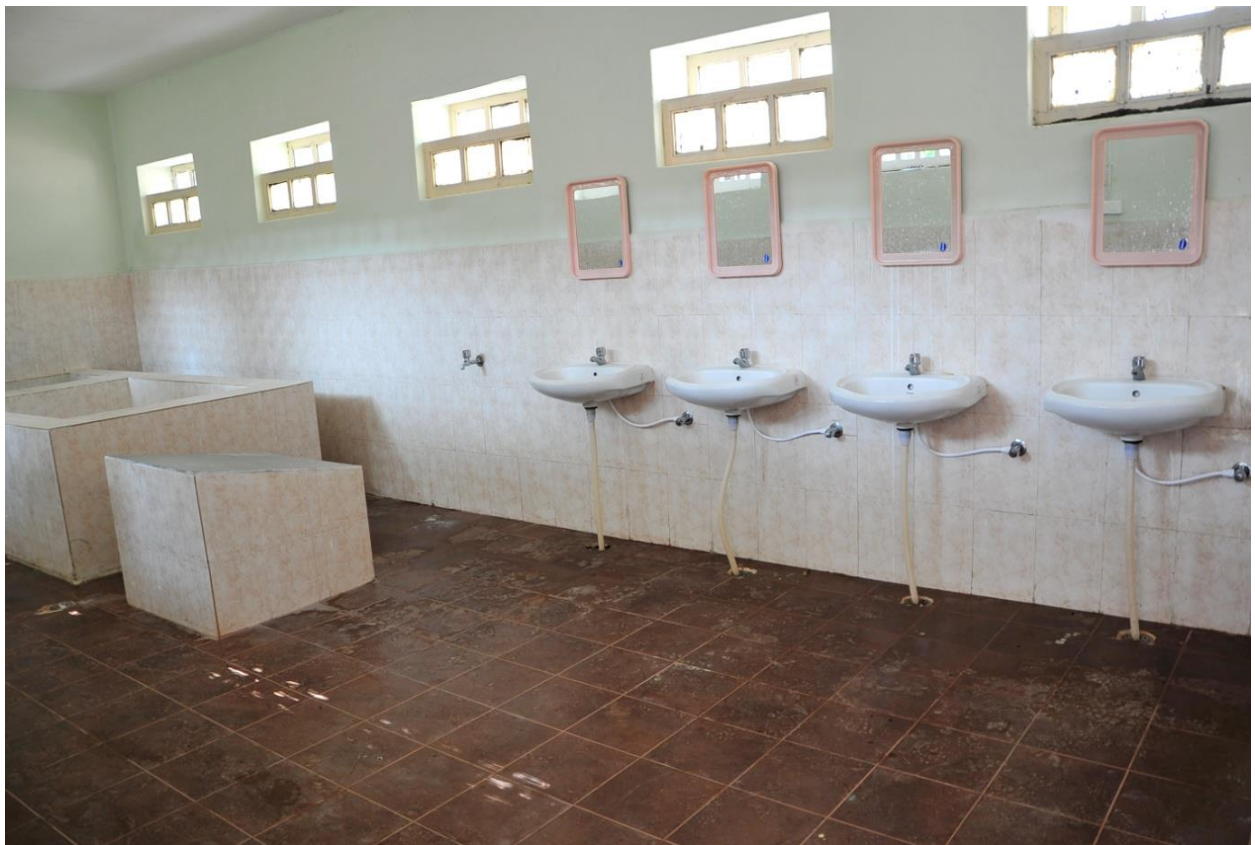
Washrooms in SVU Hostels