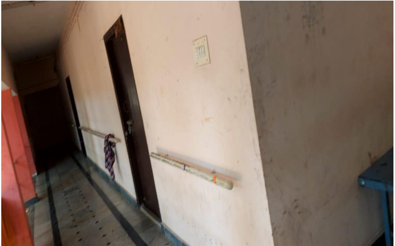
Divyangyan Friendly Ramp