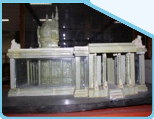
Replica of Gudimallam Temple