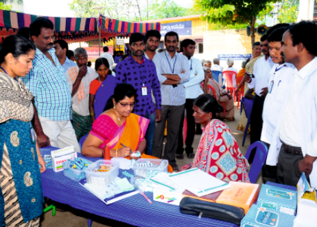
Medical Camp in Rural Areas (Kottala, Chandragiri Mandal)