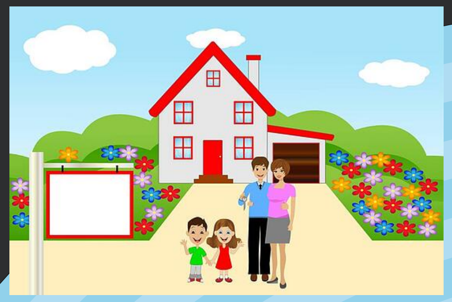
A small family is sweet, but a big family is a crowd POPULATION