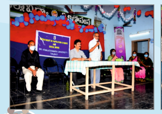
Outreach programmes at District Institute of Education and Training, Karvetinagaram.