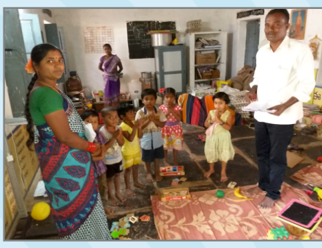
Extension Programme at Anganwadi Centre (Mallavaram, Renigunta Mandal)