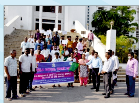
World Social Work Day-2022 Celebrations