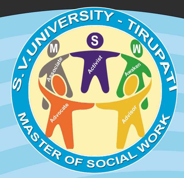
Alone we can do so little; together we can do so much. SOCIAL WORK